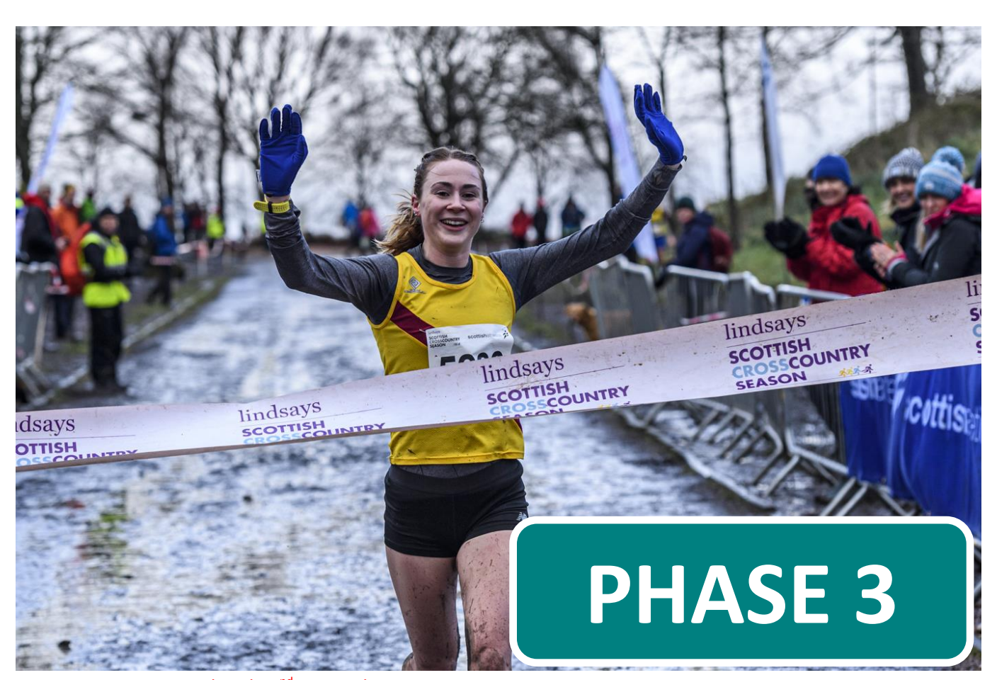
Version 1.02 updated 22<sup>nd</sup> September

This practical guide, prepared by our team in consultation with sport scotland and UK Athletics in line with government guidelines, outlines the specific measures scottish athletics recommends that event organisers take to ensure a safe return to cross country activity.